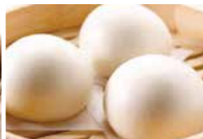
香滑莲蓉包 (3个) Steamed Lotus Paste Bun (3pcs) $7.20