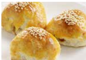
蜜汁叉烧酥 (3个) Baked BBQ Pork Pastry (3pcs) $7.20