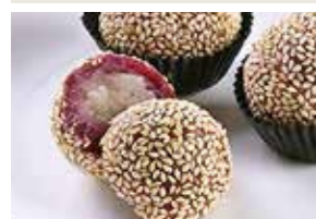
紫薯芋泥炸煎堆 (3粒) Deep-fried Purple Sweet Potato Ball with Yam (3pcs) $7.20