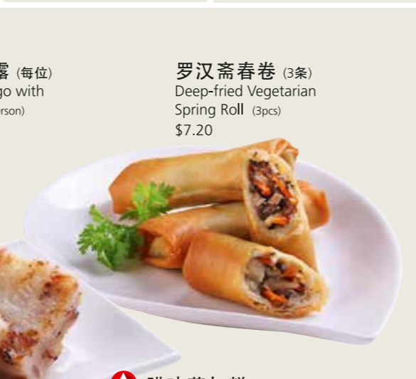
罗汉斋春卷 (3条) Deep-fried Vegetarian Spring Roll (3pcs) $7.20