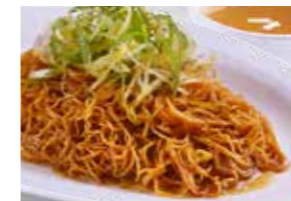
姜葱捞面 (干捞) Noodles with Ginger & Spring Onion (Dry) $7.00