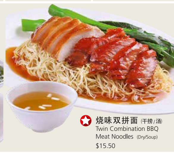
烧味双拼面 (干捞/汤) Twin Combination BBQ Meat Noodles (Dry/Soup) $15.50