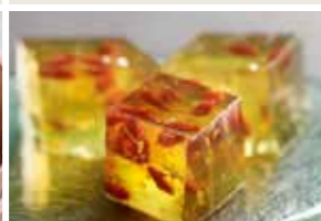
水晶杞子桂花糕 (3件) Osmanthus Jelly with Wolfberries (3pcs) $6.60