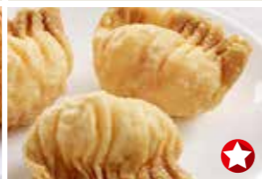
沙律明虾角 (3粒) Deep-fried Prawn Dumpling with Mayonnaise Dip (3pcs) $7.80