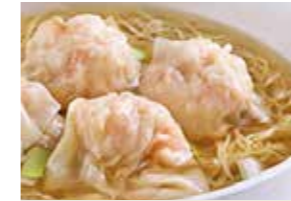
鲜虾云吞面 (汤) Shrimp Wonton Noodles (Soup) $11.40