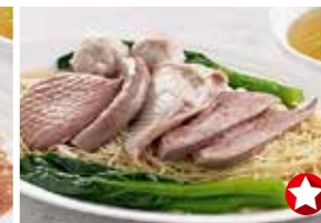
及第捞面 (干捞) Noodles with Pig's Gilet (Dry) $12.30