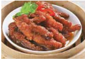
豉汁蒸凤爪 (碟) Steamed Chicken Feet with Black Bean Sauce (plate) $7.00