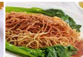
虾籽捞面 (干捞) Noodles with Shrimp Roe (Dry) $9.00