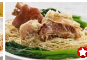
四宝招牌面 (干捞/汤) Treasures Signature Noodles with Pig's Trotter, Beef Brisket, Wonton & Shrimp Dumpling (Dry/Soup) $13.00