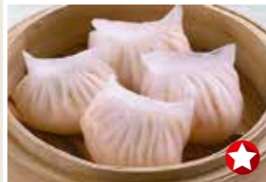
笋尖鲜虾饺 (4粒) Steamed Prawn Dumpling 'Ha Kau' (4pcs) $8.00