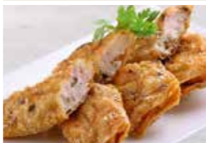
鲜虾腐皮卷 (3条) Deep-fried Beancurd Skin Roll with Shrimp (3pcs) $7.80