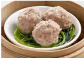
时蔬牛肉球 (3粒) Steamed Beef Ball with Vegetable (3pcs) $7.20