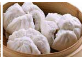
蚝皇叉烧包 (3个) Steamed BBQ Pork Bun (3pcs) $6.90