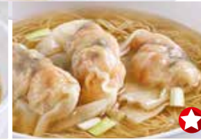
凤城水饺面 (汤) Shrimp Dumpling Noodles (Soup) $11.40