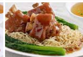
南乳猪手面 (干捞/汤) Pig's Trotter Noodles (Dry/Soup) $11.40