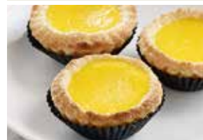
酥皮蛋挞仔 (3个) Baked Egg Tart (3pcs) $6.90