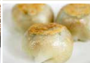
香煎韭菜粿 (3粒) Pan-fried Chive Dumpling (3pcs) $7.20