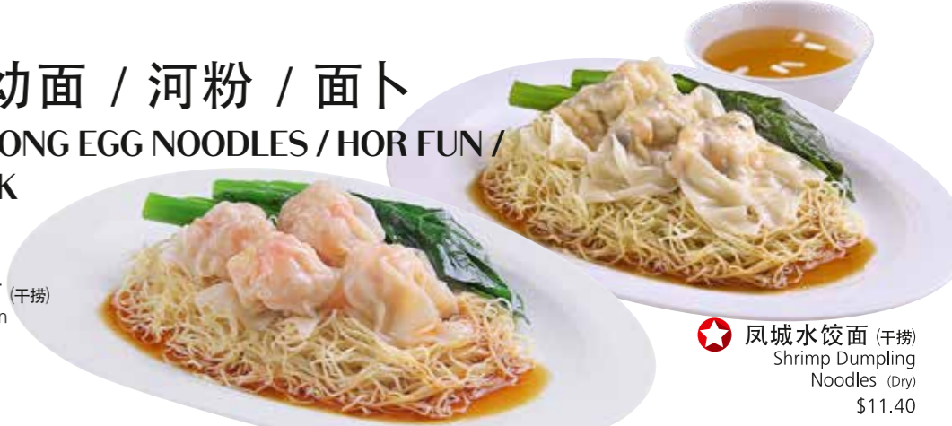
凤城水饺面 (干捞) Shrimp Dumpling Noodles (Dry) $11.40