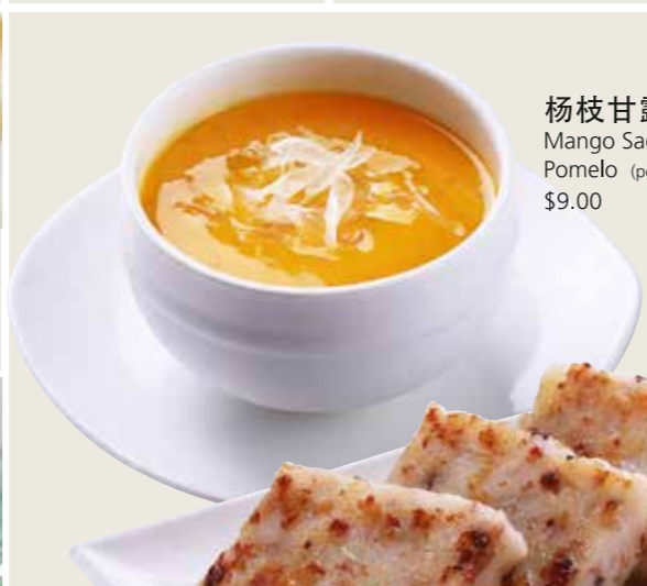
杨枝甘露 (每位) Mango Sago with Pomelo (person) $9.00