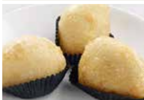
安虾咸水角 (3粒) Deep-fried Glutinous Dumpling (3pcs) $7.20