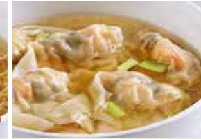
凤城水饺汤 Shrimp Dumpling Soup $11.40