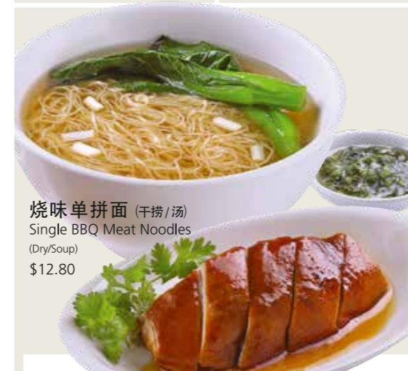
烧味单拼面 (干捞/汤) Single BBQ Meat Noodles (Dry/Soup) $12.80