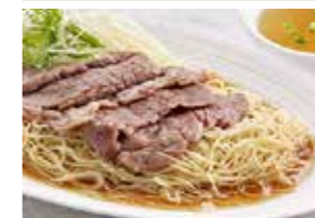
姜葱安格斯牛肉面 (干捞/汤) Angus Beef Noodles with Ginger & Spring Onion (Dry/Soup) $15.50