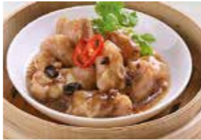
豉汁蒸排骨 (碟) Steamed Pork Rib with Black Bean Sauce (plate) $7.00