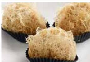
蜂巢炸芋角 (3粒) Deep-fried Yam Puff (3pcs) $7.20