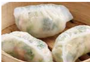
鲜虾菜苗饺 (3粒) Prawn & Vegetable Dumpling (3pcs) $7.50