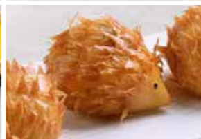
箭猪豆沙包 (3个) Deep-fried Porcupine Bun with Red Bean Paste (3pcs) $7.50