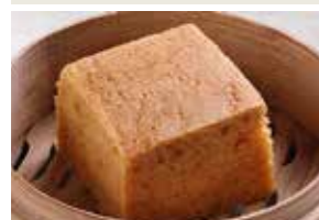
香滑马来糕 (1件) Steamed 'Malay' Sponge Cake (1pc) $6.60