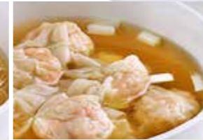
鲜虾云吞汤 Shrimp Wonton Soup $11.40