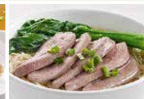
鲜猪润面 (干捞/汤) Pig's Liver Noodles (Dry/Soup) $11.80