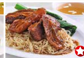
柱侯牛腩面 (干捞/汤) Beef Brisket Noodles (Dry/Soup) $11.40