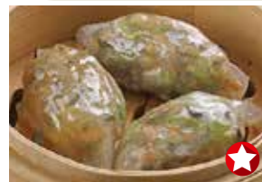
杂菌如意饺 (3粒) Steamed Diced Mushroom Dumpling (3pcs) $7.20