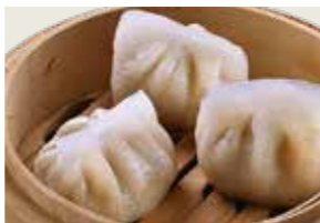
潮州蒸粉粿 (3粒) Steamed 'Teochew' Dumpling (3pcs) $7.20