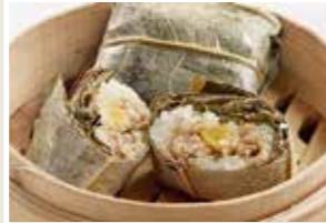
珍珠糯米鸡 (2粒) Steamed Glutinous Rice with Shrimp in Lotus Leaf (2pcs) $7.00