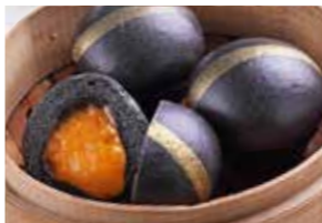
黑金流沙包 (3个) Steamed Salted Egg Yolk Black Custard Bun (3pcs) $7.50