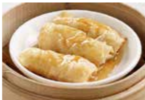
蚝皇鲜竹卷 (3条) Steamed Beancurd Skin Roll with Oyster Sauce (3pcs) $6.90