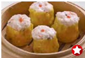
香菇烧卖皇 (4粒) Steamed Pork Dumpling with Shrimp 'Siew Mai' (4pcs) $7.80