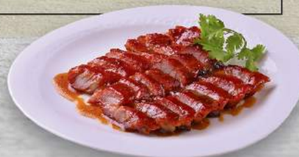
叉烧 Barbecue Pork

PARAGON #B1-08 | T: (65) 6262 3662 PARKWAY PARADE #02-14/17 | T: (65) 6247 9218 RAFFLES CITY #B1-37 | T: (65) 6262 1662