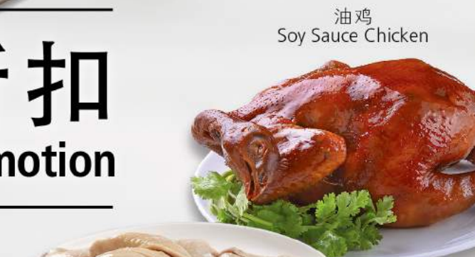
油鸡 Soy Sauce Chicken