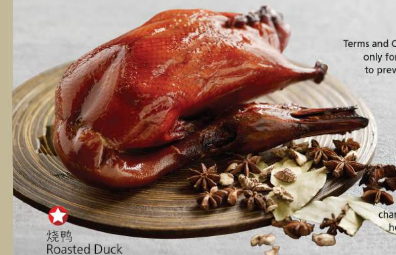
烧鸭 Roasted Duck

Terms and Conditions: Promotion is valid only for takeaway. Prices are subject to prevailing GST, where applicable. Valid only at all Treasures by Imperial Treasure outlets. Not applicable with other discounts or promotions. Earning of i-dollars (i$) and redemption of membership privileges are allowed. Imperial Treasure Restaurant Group reserves the right to change the terms and conditions herewith without prior notice.