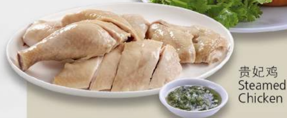
贵妃鸡 Steamed Chicken