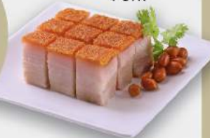
脆皮靓烧肉 Crispy Roasted Pork