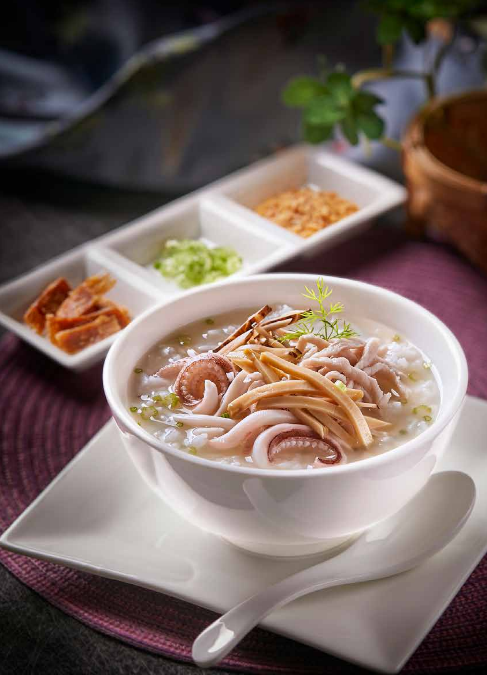
鮑魚三絲粥 Congee with Shredded Abalone, Shredded Cuttlefish & Shredded Pork