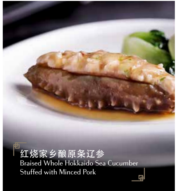
红烧家乡酿原条辽参 Braised Whole Hokkaido Sea Cucumber Stuffed with Minced Pork