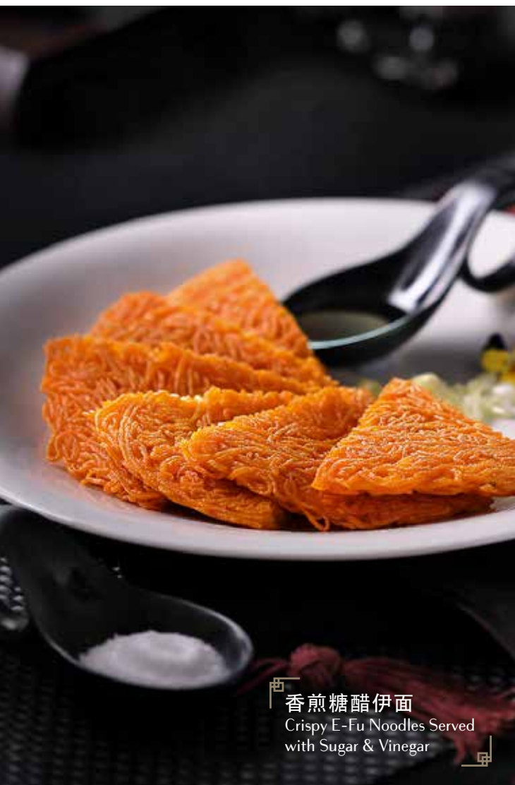
香煎糖醋伊面 Crispy E-Fu Noodles Served with Sugar & Vinegar