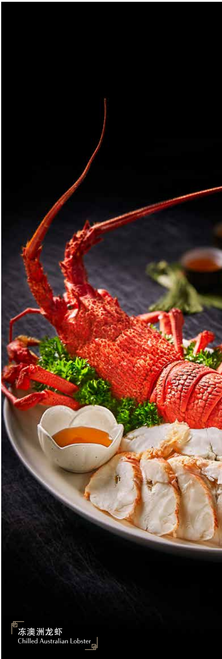
冻澳洲龙虾 Chilled Australian Lobster