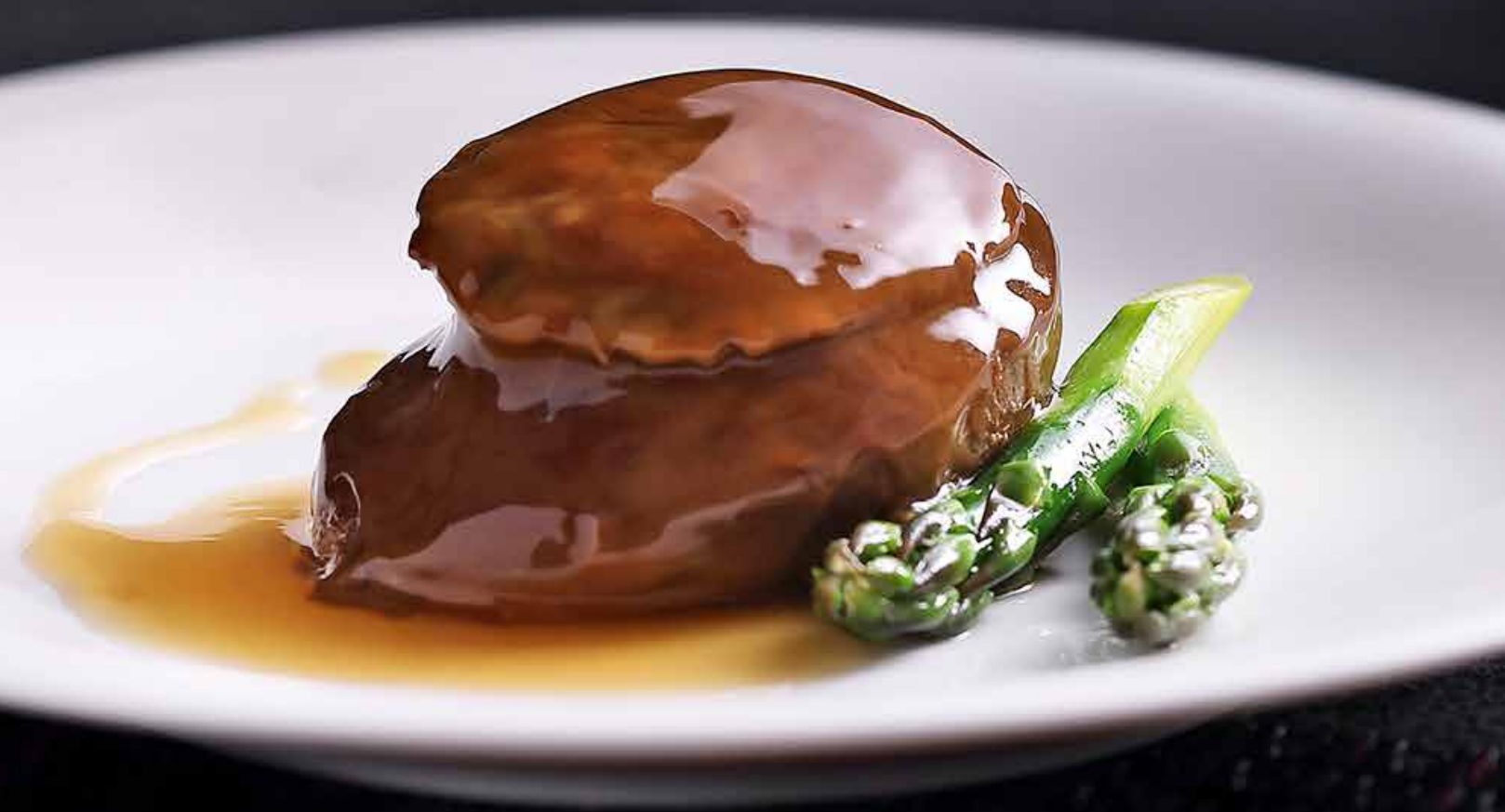
西 | 红烧原只澳洲鲜鲍鱼 Braised Australian Whole Abalone in Oyster Sauce | 甲