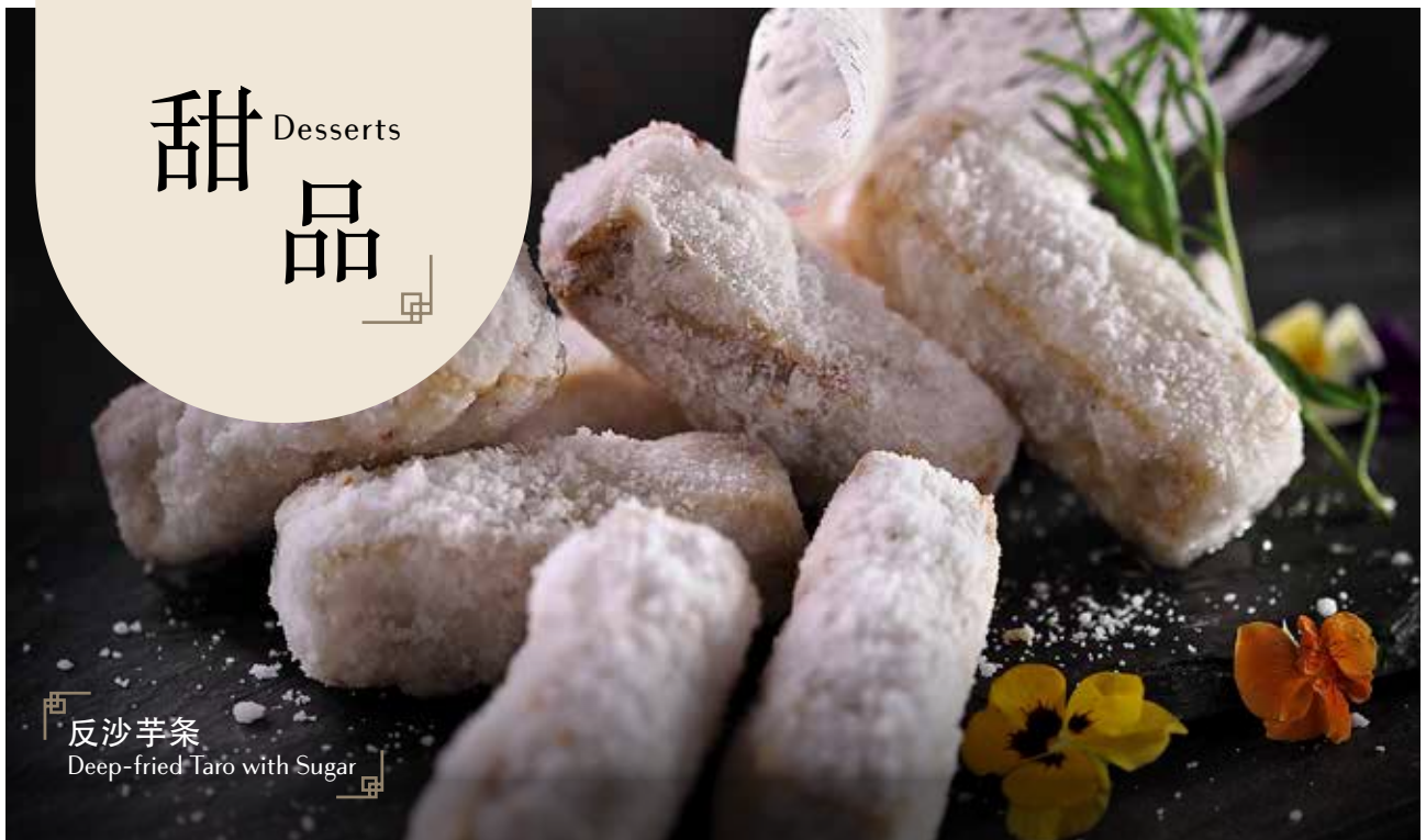
反沙芋条 Deep-fried Taro with Sugar

冰花炖官燕 (冻) Double-boiled Bird's Nest with Rock Sugar (Cold) $138.00 每三十克/Per 30g