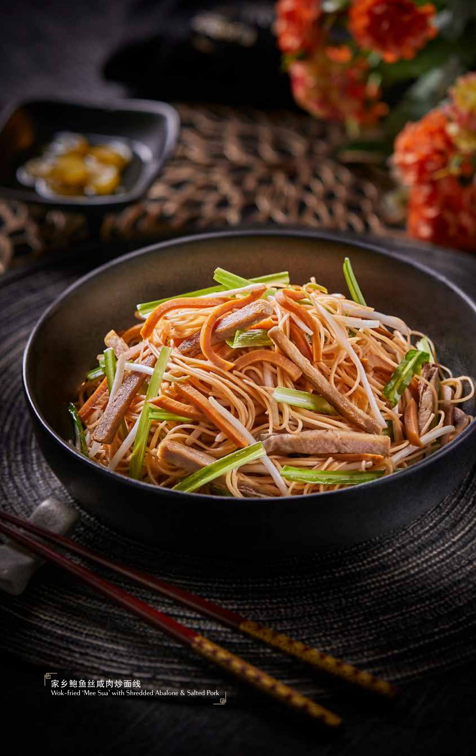
家乡鲍鱼丝咸肉炒面线 Wok-fried 'Mee Sua' with Shredded Abalone & Salted Pork