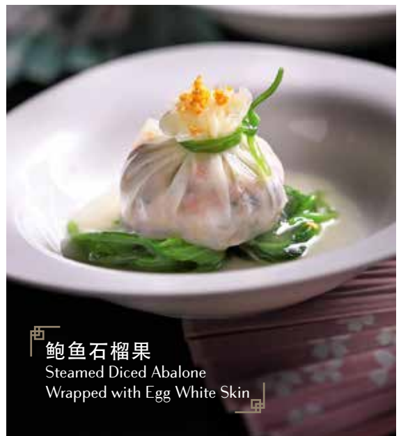
鲍鱼石榴果 Steamed Diced Abalone Wrapped with Egg White Skin