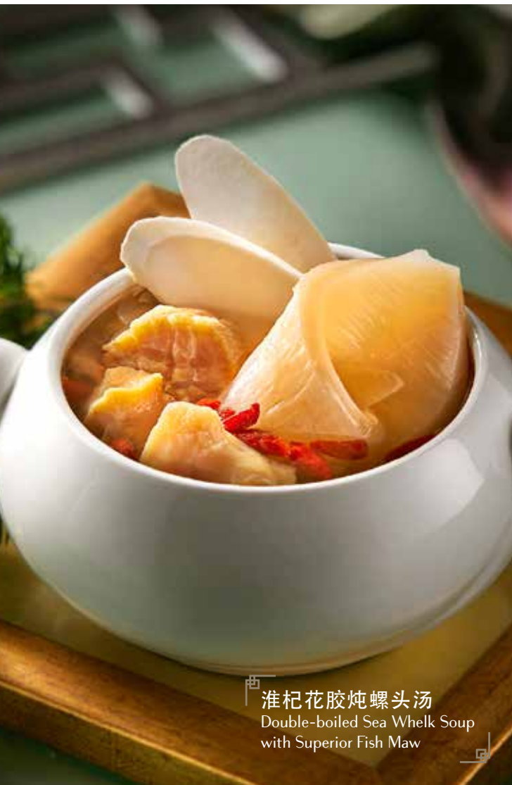
淮杞花胶炖螺头汤 Double-boiled Sea Whelk Soup with Superior Fish Maw