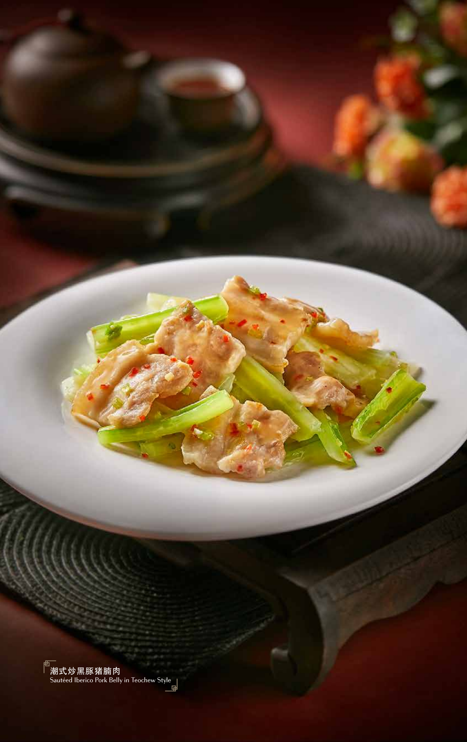
潮式炒黑豚猪腩肉 Sautéed Iberico Pork Belly in Teochew Style