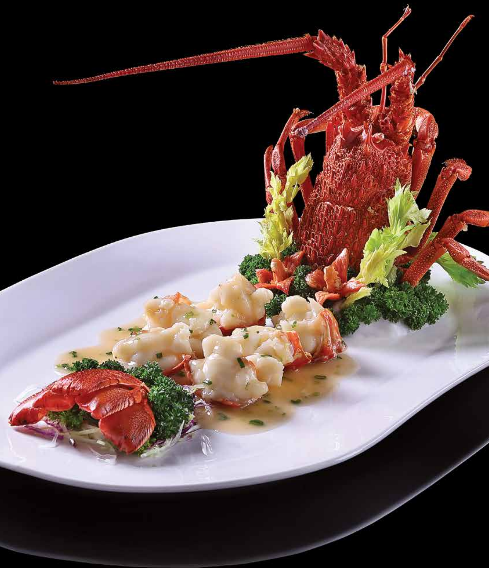
澳洲龙虾 Australian Lobster (上汤焗 Baked with Superior Broth)