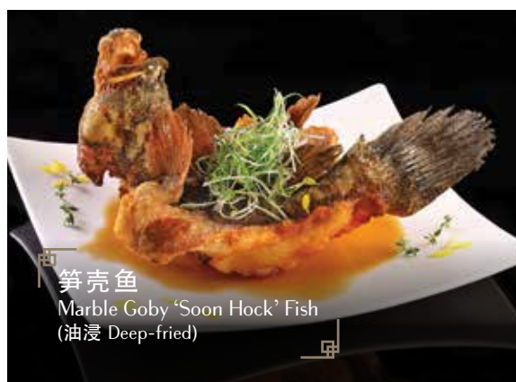
笋壳鱼 Marble Goby 'Soon Hock' Fish (油浸 Deep-fried)