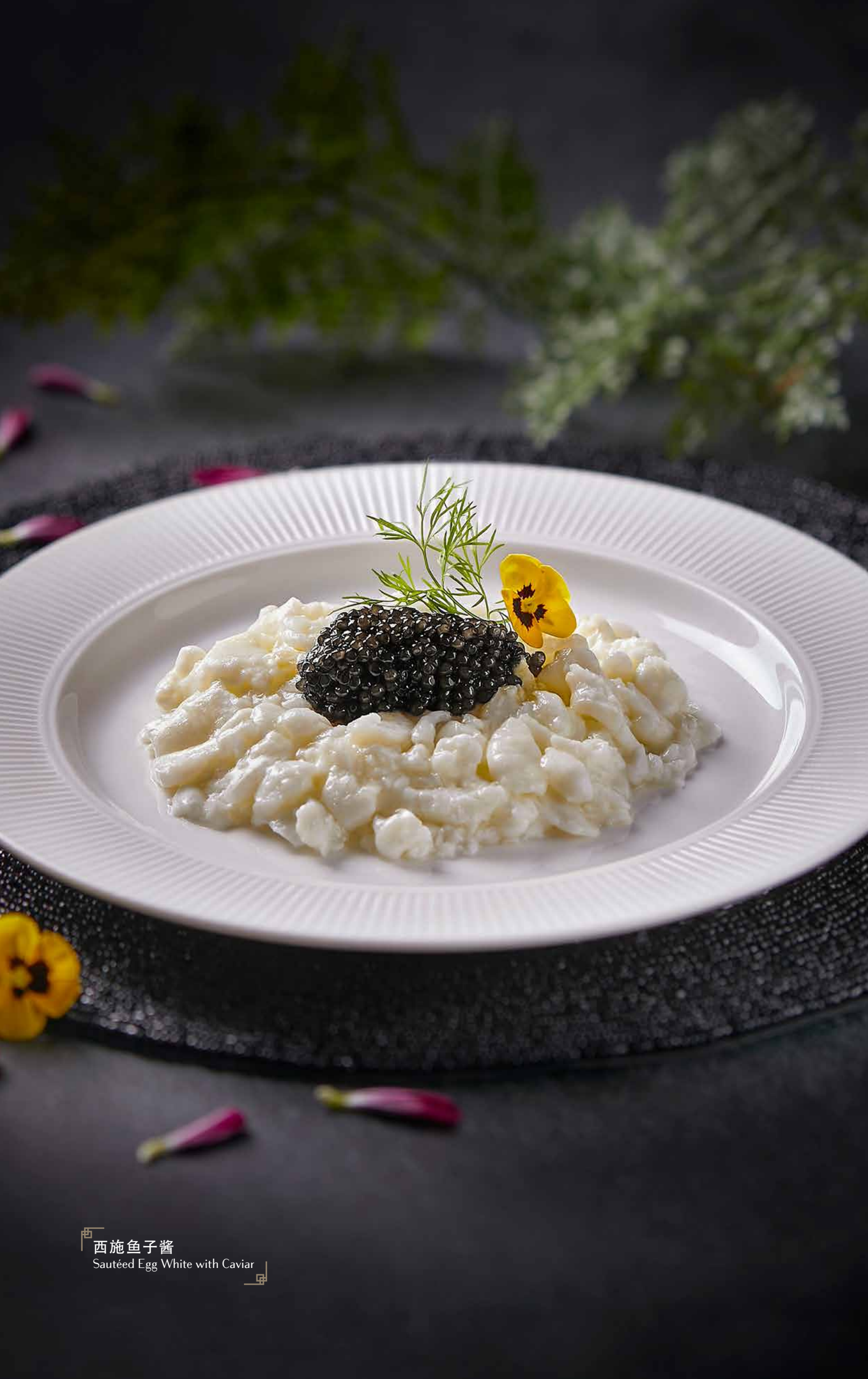
西施鱼子酱 Sautéed Egg White with Caviar