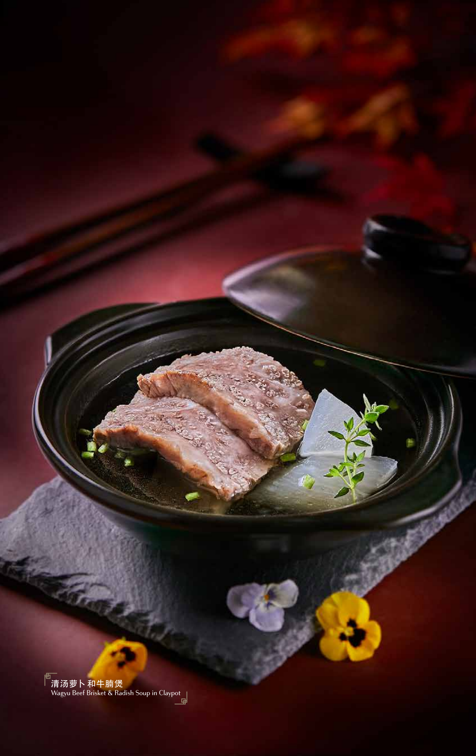
清汤萝卜 和牛腩煲 Wagyu Beef Brisket & Radish Soup in Claypot