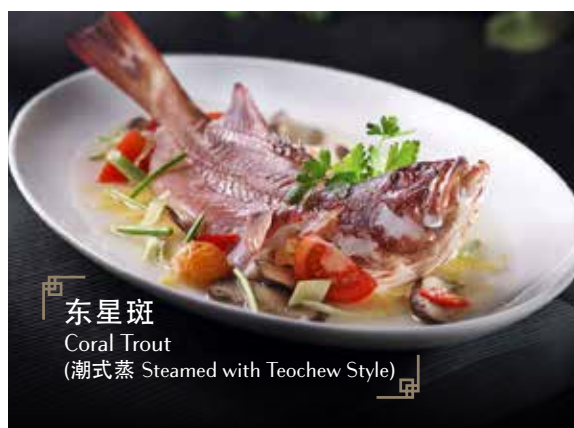
东星斑 Coral Trout (潮式蒸 Steamed with Teochew Style)