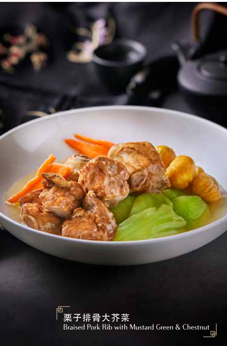
栗子排骨大芥菜 Braised Pork Rib with Mustard Green & Chestnut