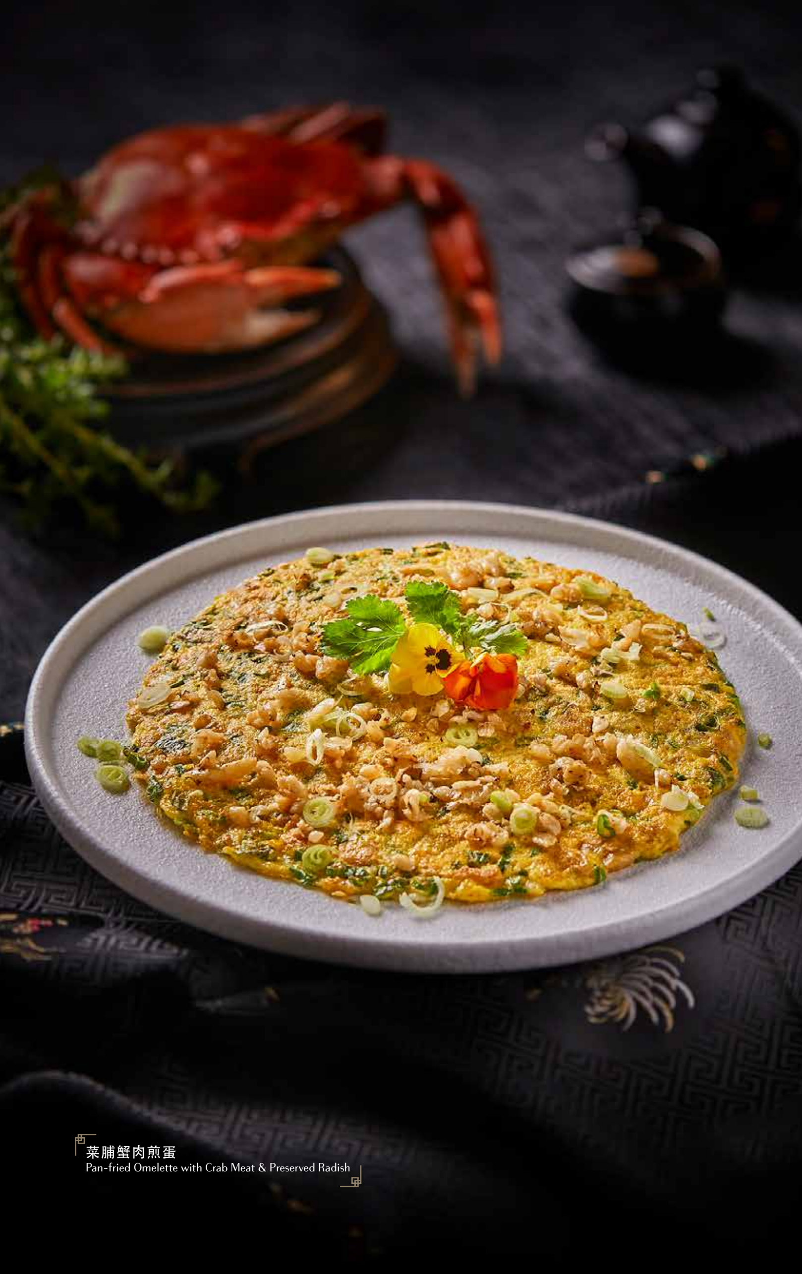
菜脯蟹肉煎蛋 Pan-fried Omelette with Crab Meat & Preserved Radish