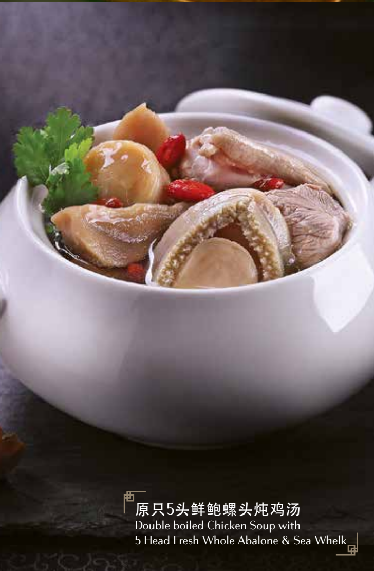
原只5头鲜鲍螺头炖鸡汤 Double-boiled Chicken Soup with 5 Head Fresh Whole Abalone & Sea Whelk