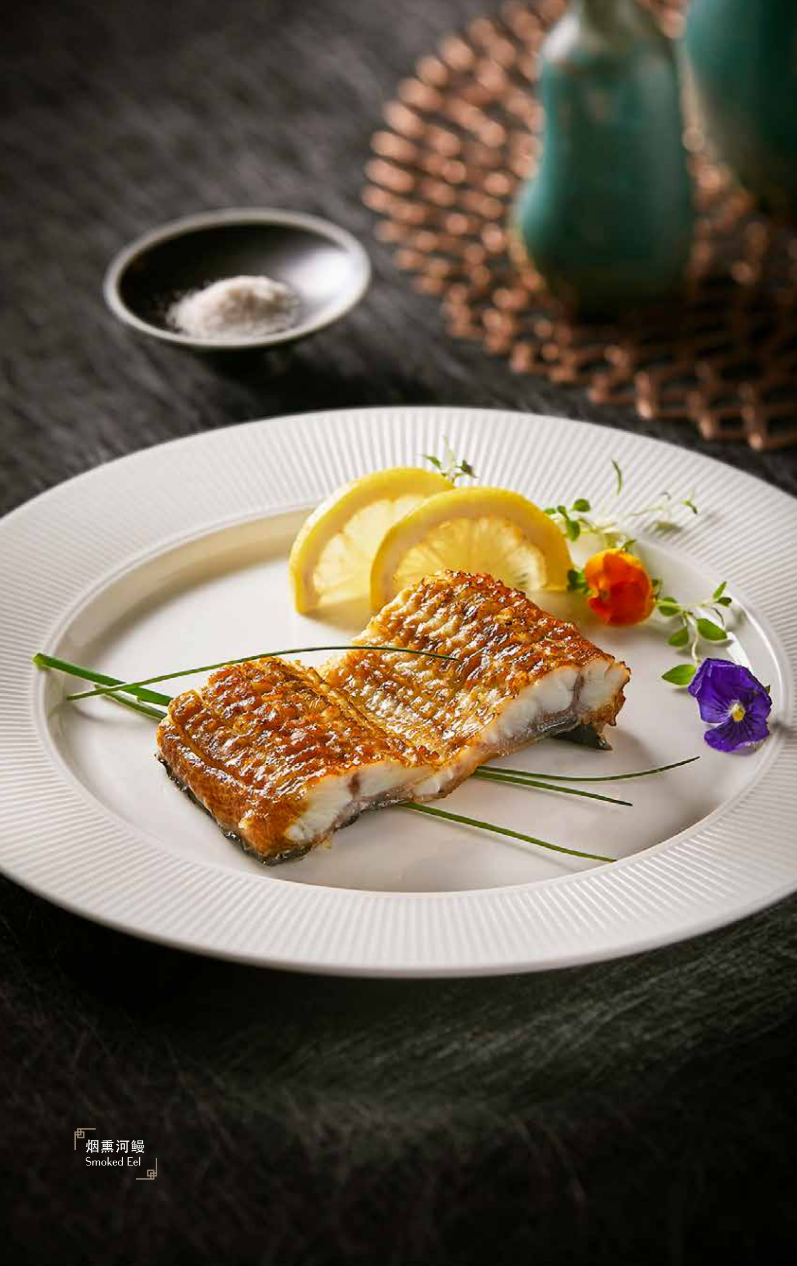
烟熏河鳗 Smoked Eel