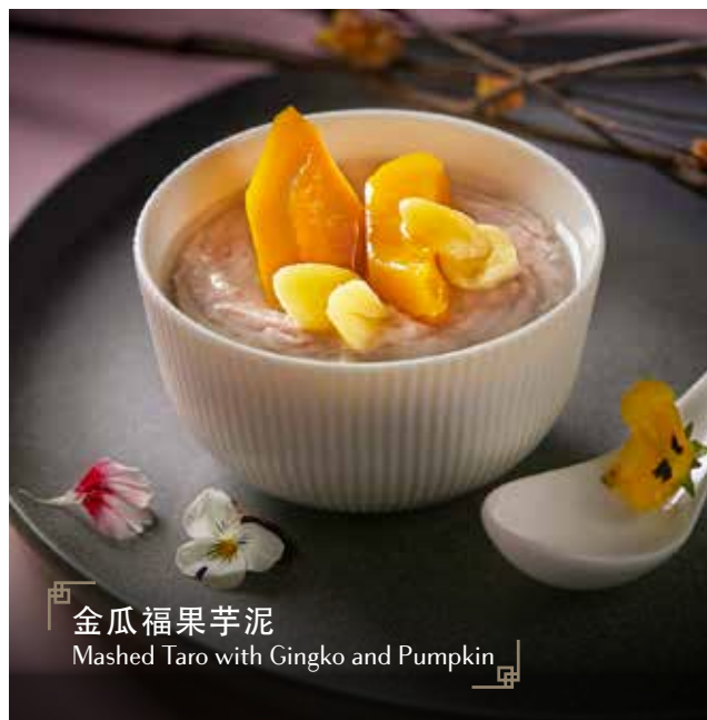
金瓜福果芋泥 Mashed Taro with Gingko and Pumpkin

鲜果芦荟冻 Chilled Aloe Vera Jelly with Fresh Fruits $11.00 每位/Per Person