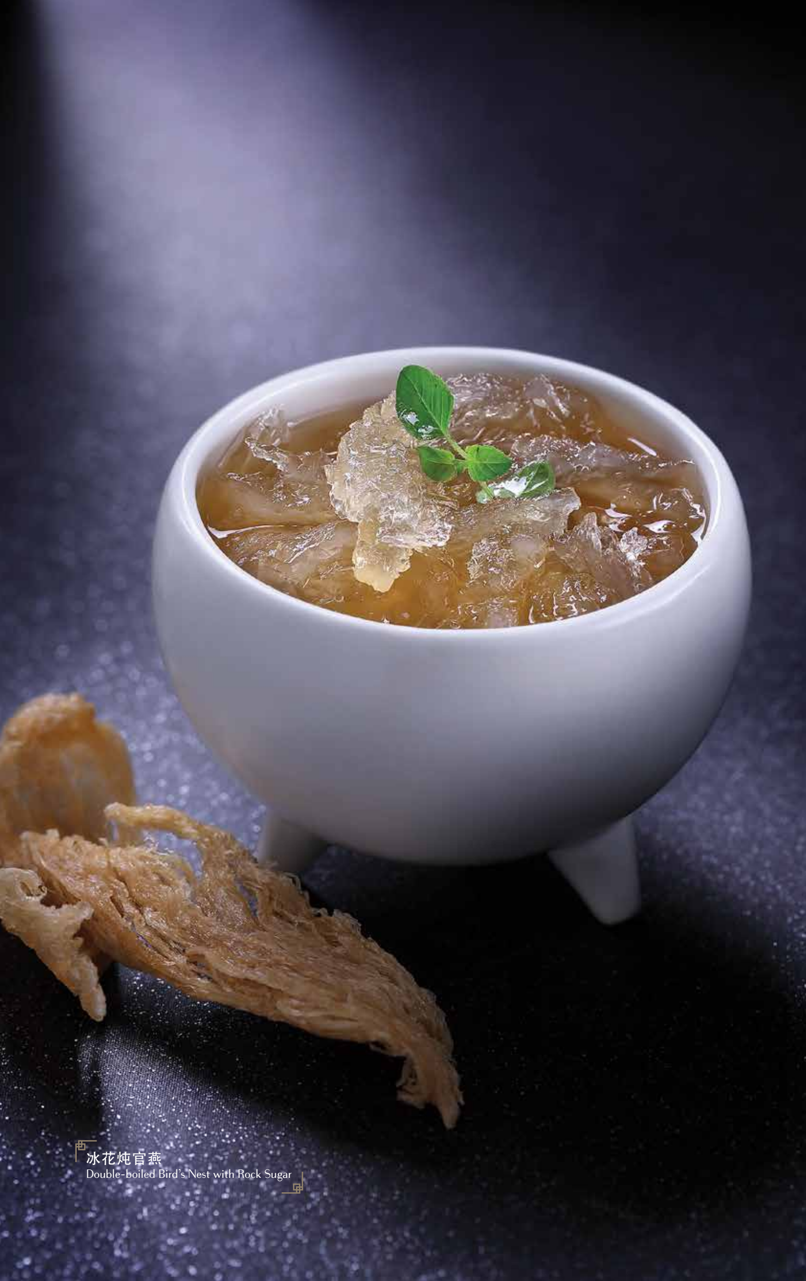
冰花炖官燕 Double-boiled Bird's Nest with Rock Sugar