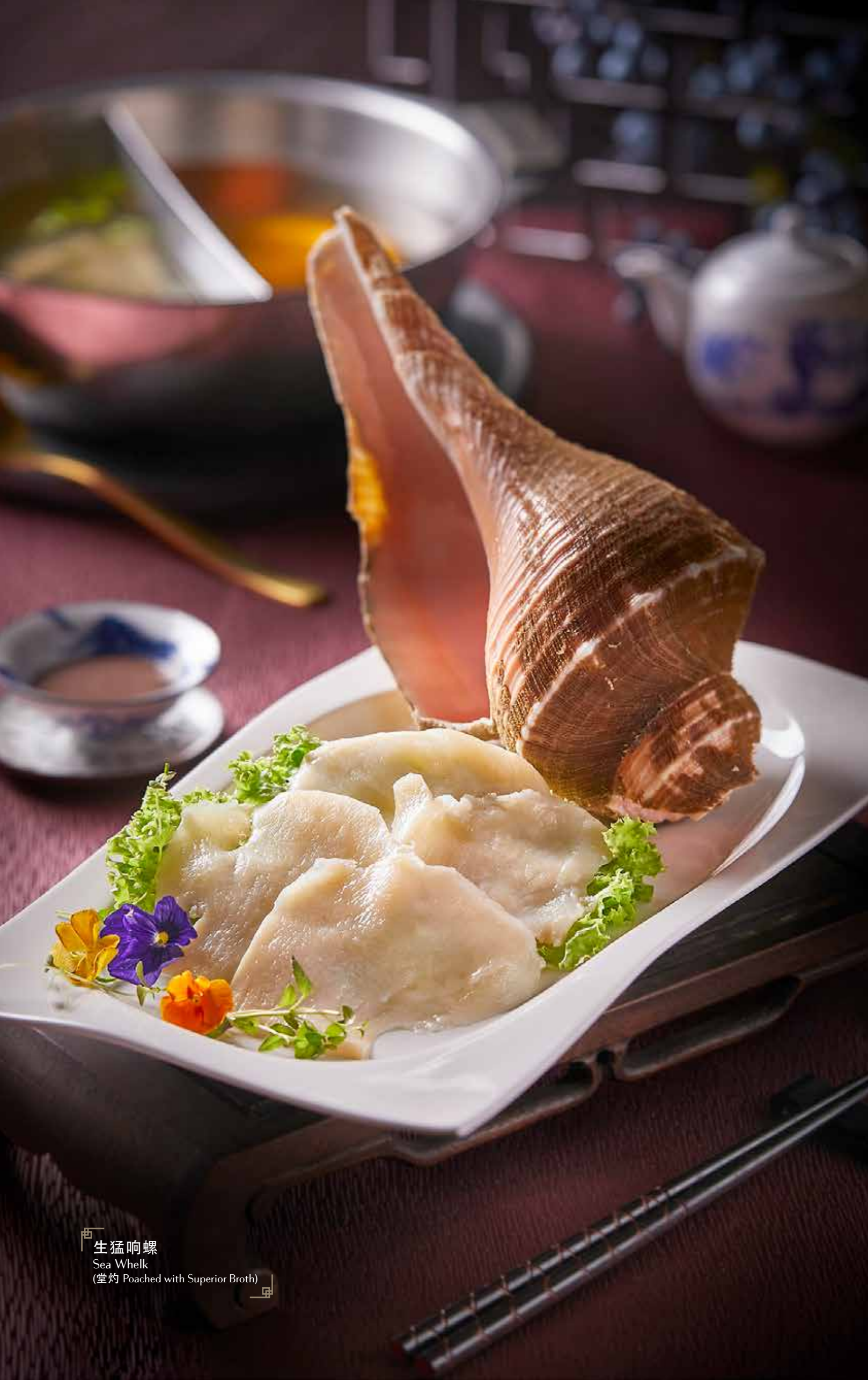
生猛响螺 Sea Whelk (堂灼 Poached with Superior Broth)