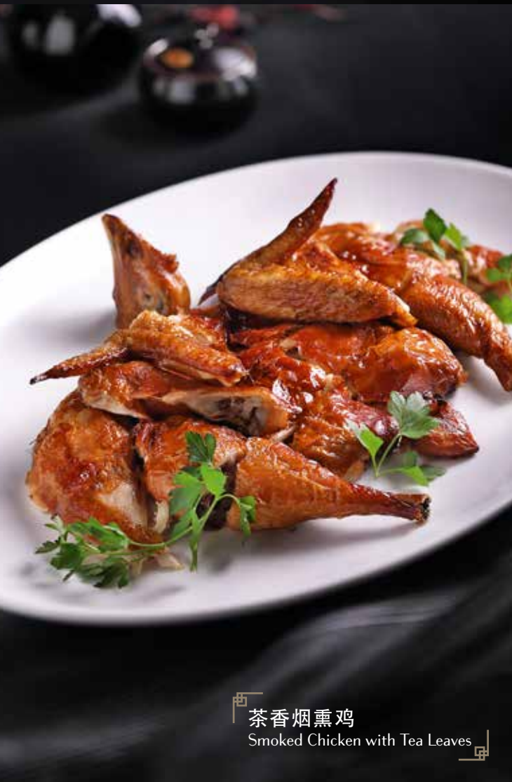
茶香烟熏鸡 Smoked Chicken with Tea Leaves