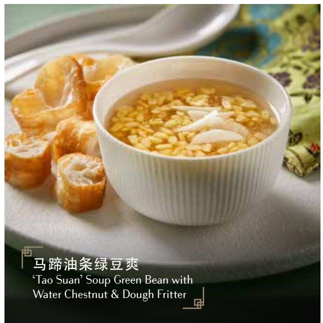
马蹄油条绿豆爽 'Tao Suan' Soup Green Bean with Water Chestnut & Dough Fritter