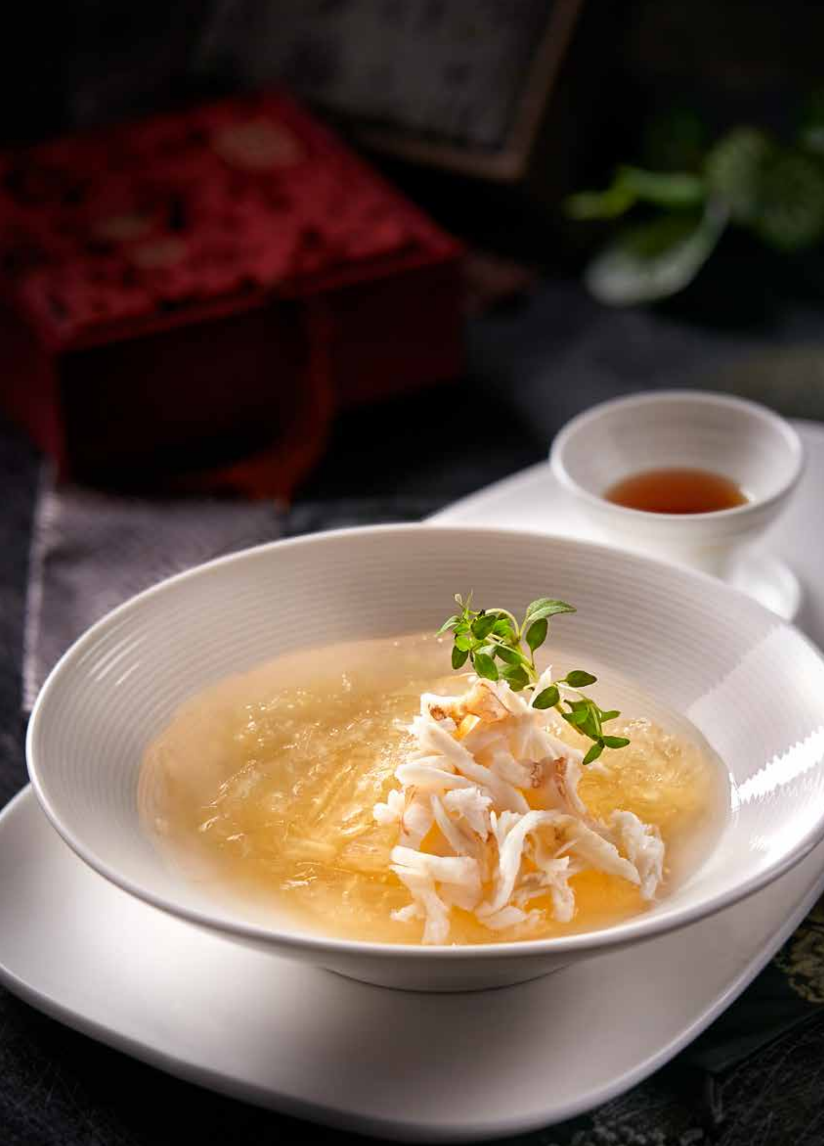
蟹肉烩官燕 Braised Bird's Nest with Crab Meat