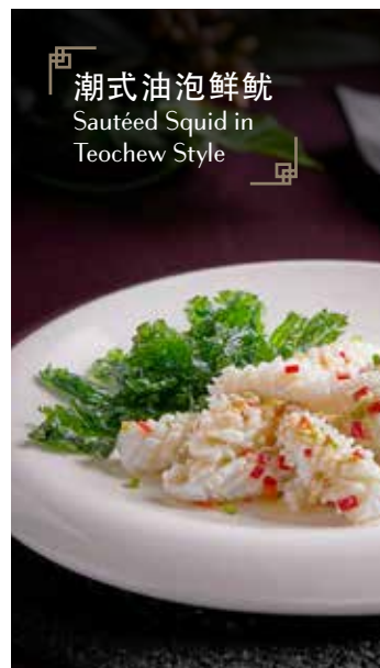
潮式油泡鲜鱿 Sautéed Squid in Teochew Style