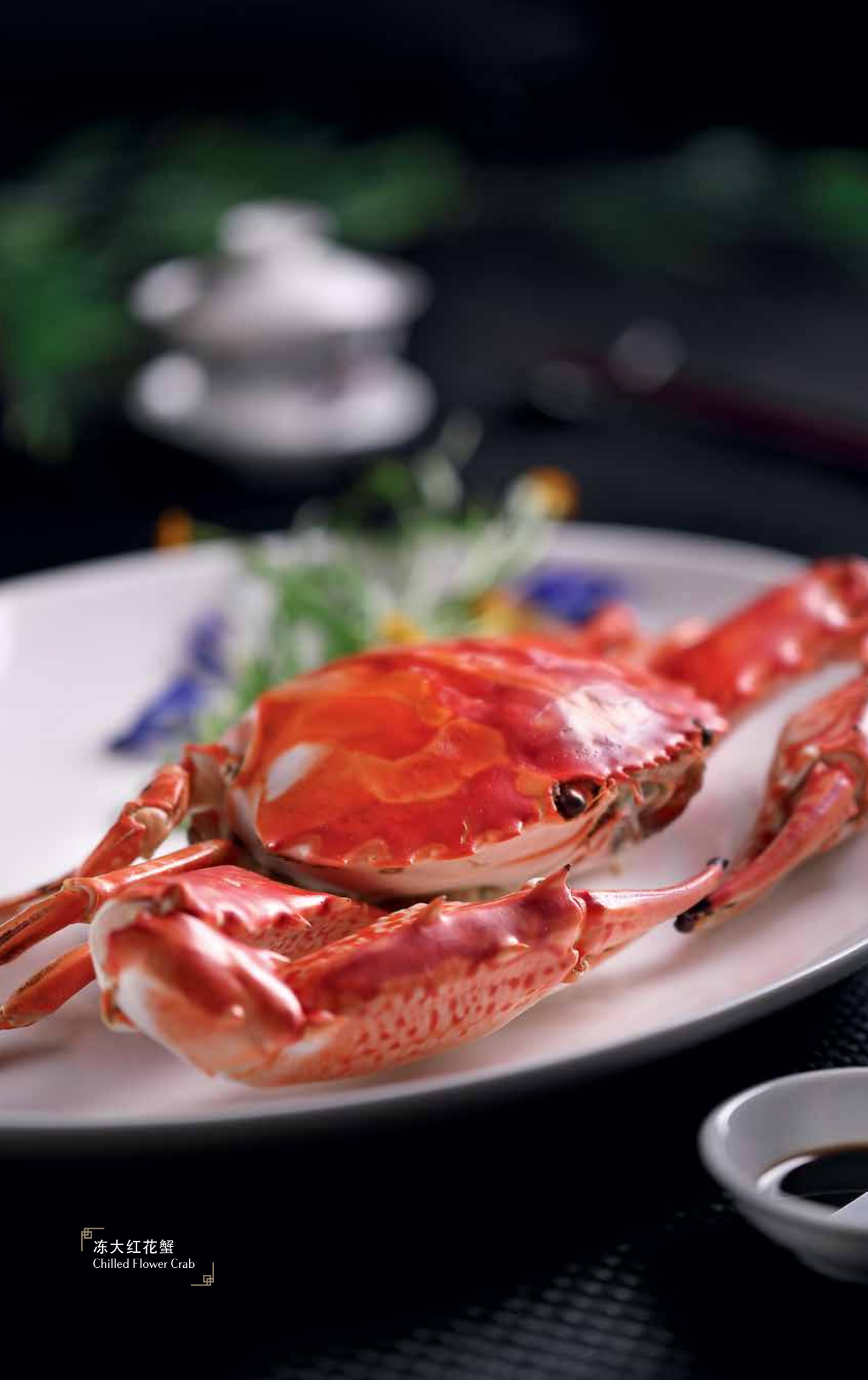
冻大红花蟹 Chilled Flower Crab