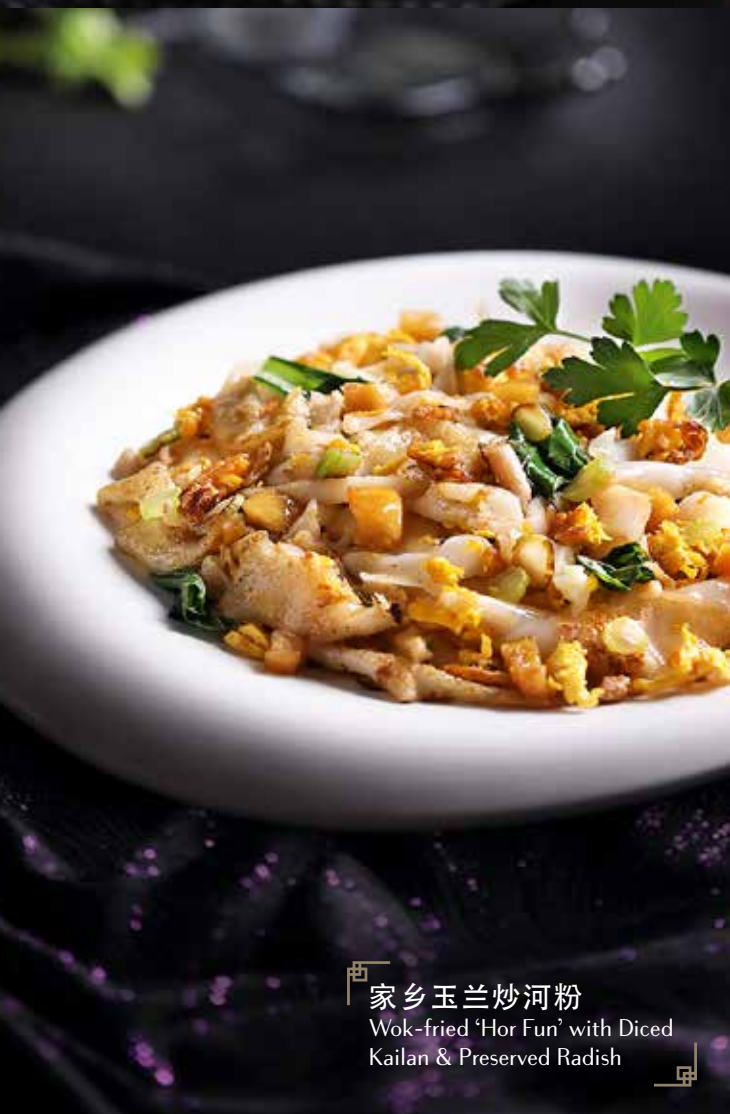
家乡玉兰炒河粉 Wok-fried 'Hor Fun' with Diced Kailan & Preserved Radish